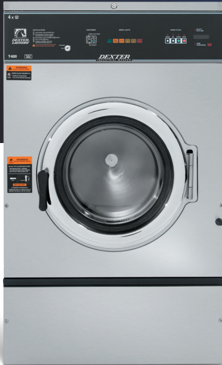
6 Cycle Control